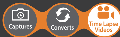
Instant Time Lapse Video

TLC200 Pro captures and converts thousands of photos into a Time Lapse video.