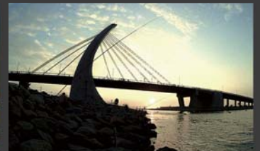
Normal image sensor