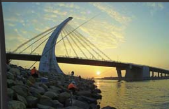
HDR image sensor